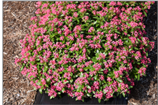
Soiree Kawaii Coral Vinca in bloom

Soiree Kawaii Coral Vinca will grow to be about 10 inches tall at maturity, with a spread of 18 inches. Its foliage tends to remain low and dense right to the ground. Although it's not a true annual, this fast-growing plant can be expected to behave as an annual in our climate if left outdoors over the winter, usually needing replacement the following year. As such, gardeners should take into consideration that it will perform differently than it would in its native habitat.