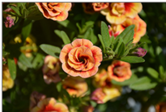
MiniFamous Double Orange Strike Calibrachoa flowers

This plant will require occasional maintenance and upkeep. Trim off the flower heads after they fade and die to encourage more blooms late into the season. It is a good choice for attracting bees and hummingbirds to your yard, but is not particularly attractive to deer who tend to leave it alone in favor of tastier treats. It has no significant negative characteristics.