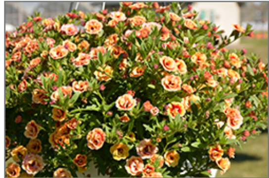
MiniFamous Double Orange Strike Calibrachoa in bloom

MiniFamous Double Orange Strike Calibrachoa is a fine choice for the garden, but it is also a good selection for planting in outdoor containers and hanging baskets. Because of its trailing habit of growth, it is ideally suited for use as a 'spiller' in the 'spiller-thriller-filler' container combination; plant it near the edges where it can spill gracefully over the pot. Note that when growing plants in outdoor containers and baskets, they may require more frequent waterings than they would in the yard or garden.