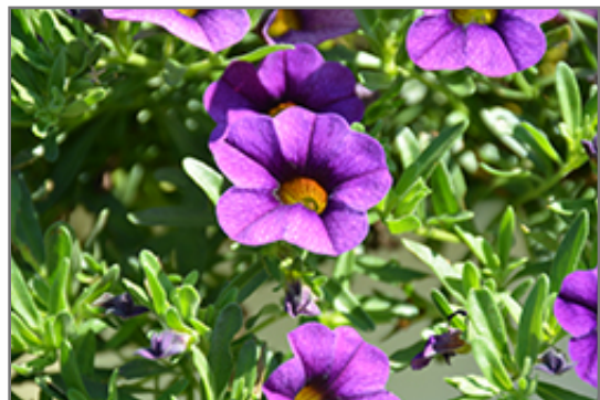
Calipetite Blue Calibrachoa flowers