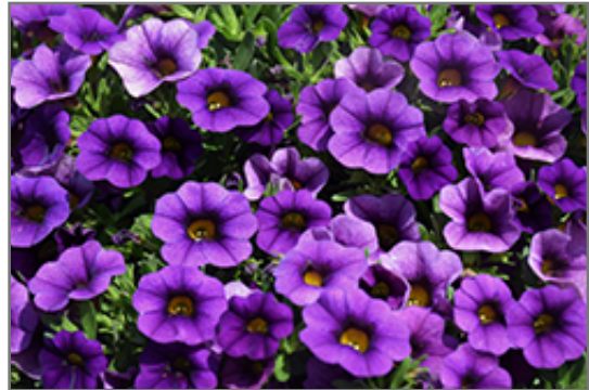
Calipetite Blue Calibrachoa flowers

Calipetite Blue Calibrachoa is recommended for the following landscape applications;