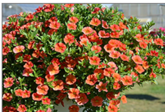
Cabaret Orange Calibrachoa in bloom