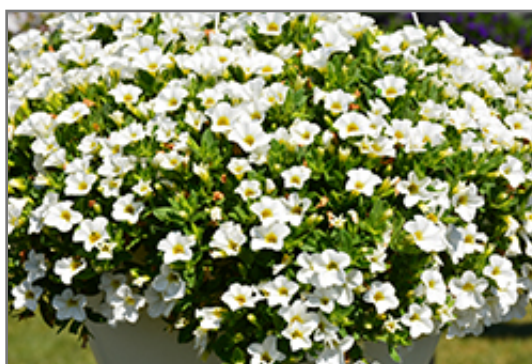
Aloha Nani White Calibrachoa flowers