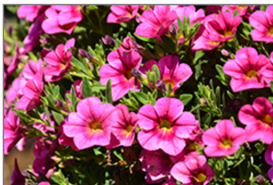
Aloha Cranberry Calibrachoa flowers