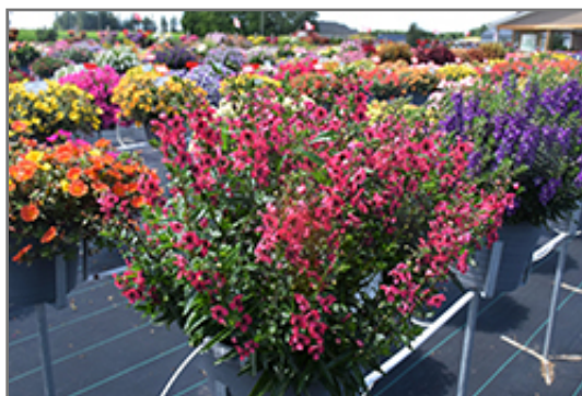
Archangel Cherry Red Angelonia in bloom