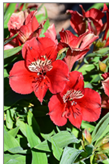
Colorita Kate Alstroemeria flowers