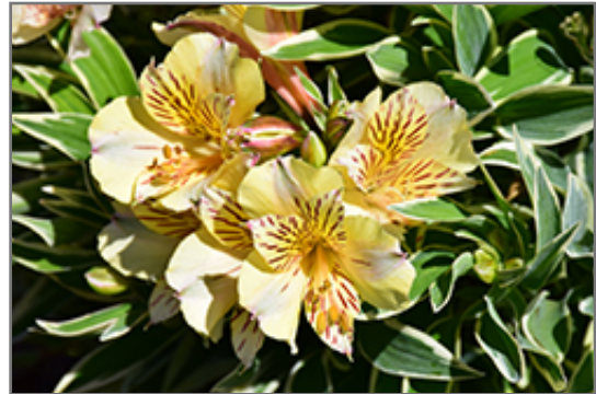
Colorita Fabiana Alstroemeria flowers