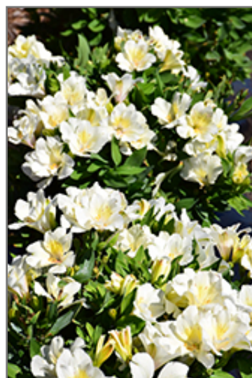
Colorita Claire Alstroemeria flowers