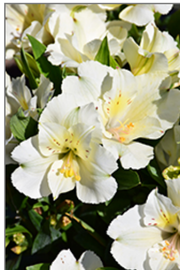
Colorita Claire Alstroemeria flowers