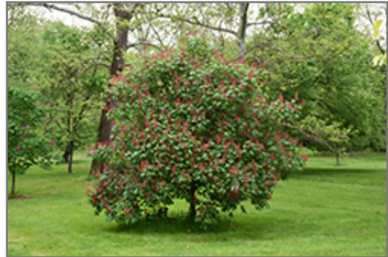
Splendens Red Buckeye in bloom