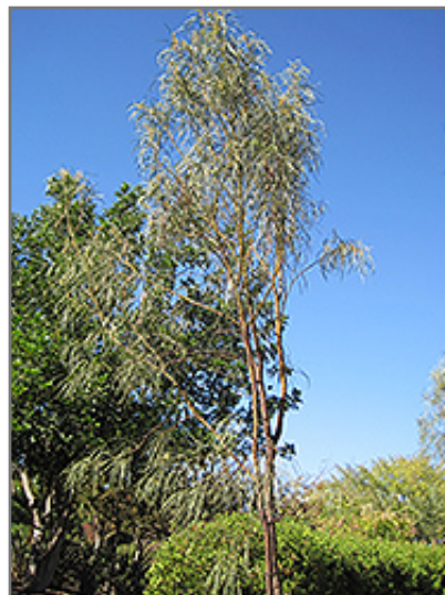
Shoestring Acacia

Shoestring Acacia is recommended for the following landscape applications;