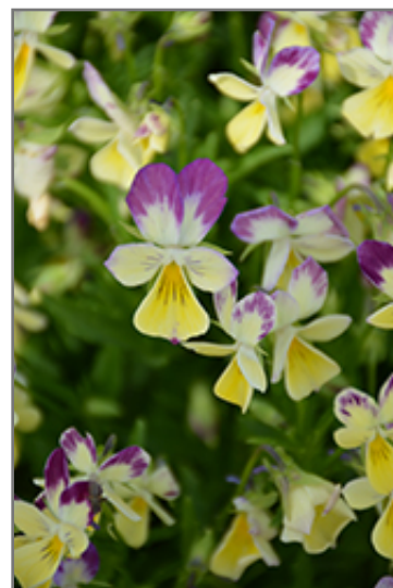
Hip Hop Honeybunny Pansy flowers

Hip Hop Honeybunny Pansy is recommended for the following landscape applications;