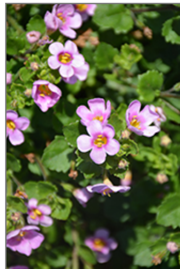
Boutique Pink Mascara Bacopa flowers