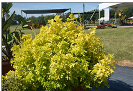
Under The Sea Yellowfin Tuna Coleus