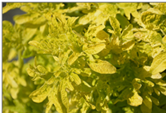
Under The Sea Yellowfin Tuna Coleus foliage

Under The Sea Yellowfin Tuna Coleus is recommended for the following landscape applications;