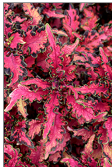
Under The Sea Pink Reef Coleus foliage

Under The Sea Pink Reef Coleus is recommended for the following landscape applications;