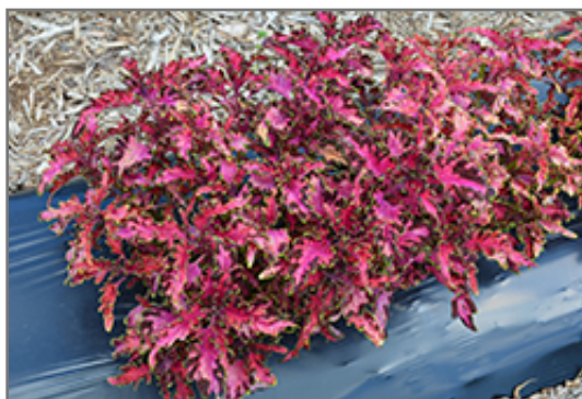
Under The Sea Pink Reef Coleus