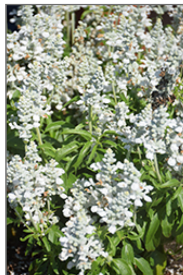
Mannequin Snow Mountain Salvia flowers

Mannequin Snow Mountain Salvia is recommended for the following landscape applications;