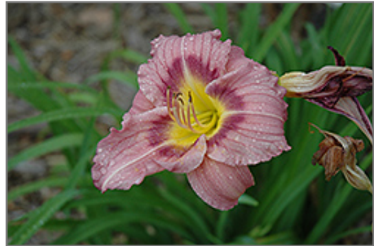
Numinous Moments Daylily flowers