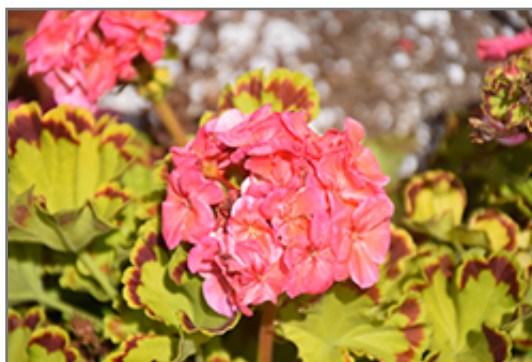
Glitterati Diva Queen Geranium flowers