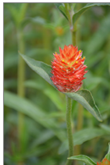
Budacious Outrageous Orange Gomphrena flowers