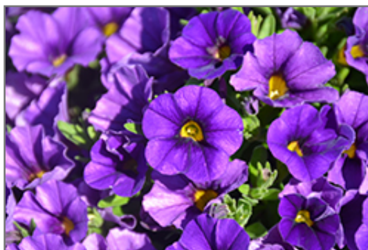
Catwalk Perfect Purple Calibrachoa flowers