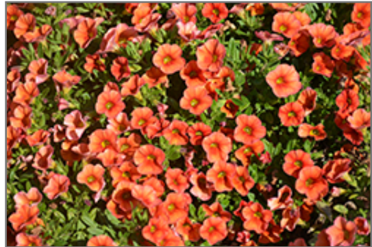
Catwalk Mandarin Glow Calibrachoa flowers

Catwalk Mandarin Glow Calibrachoa will grow to be about 8 inches tall at maturity, with a spread of 18 inches. When grown in masses or used as a bedding plant, individual plants should be spaced approximately 10 inches apart. Its foliage tends to remain low and dense right to the ground. This fast-growing annual will normally live for one full growing season, needing replacement the following year.