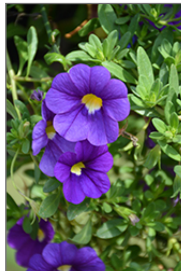
Catwalk Blue Jeans Calibrachoa flowers

Catwalk Blue Jeans Calibrachoa is recommended for the following landscape applications;