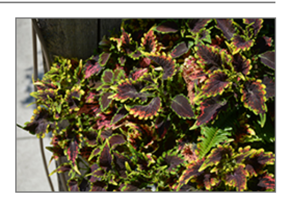
Sky Fire Coleus foliage