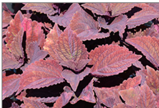
ColorBlaze Marooned Coleus foliage