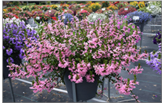
Whirlwind Pink Fan Flower in bloom

Whirlwind Pink Fan Flower is a fine choice for the garden, but it is also a good selection for planting in outdoor containers and hanging baskets. Because of its trailing habit of growth, it is ideally suited for use as a 'spiller' in the 'spiller-thriller-filler' container combination; plant it near the edges where it can spill gracefully over the pot. Note that when growing plants in outdoor containers and baskets, they may require more frequent waterings than they would in the yard or garden.