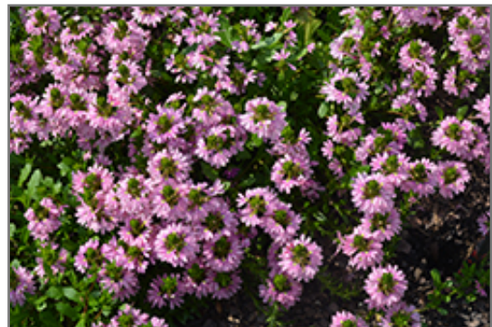
Whirlwind Pink Fan Flower flowers