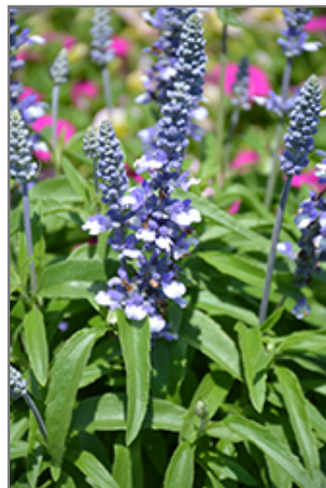
Cathedral Shining Sea Salvia flowers

Cathedral Shining Sea Salvia is recommended for the following landscape applications;