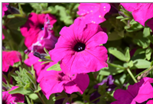
Surfinia Sumo Plum Petunia flowers