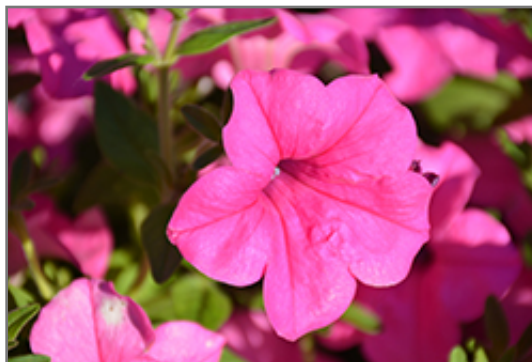
Surfinia Sumo Pink Petunia flowers

Surfinia Sumo Pink Petunia is recommended for the following landscape applications;