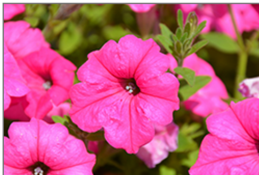
Surfinia Sumo Pink Petunia flowers

Surfinia Sumo Pink Petunia is recommended for the following landscape applications;