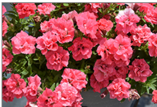
Surfinia Summer Double Salmon Petunia flowers

Surfinia Summer Double Salmon Petunia is recommended for the following landscape applications;