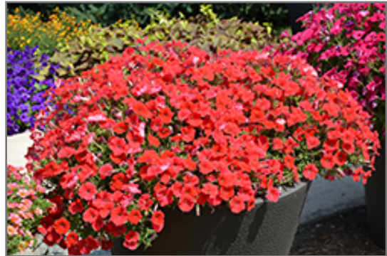
Supertunia Really Red Petunia in bloom

Supertunia Really Red Petunia will grow to be about 8 inches tall at maturity, with a spread of 12 inches. When grown in masses or used as a bedding plant, individual plants should be spaced approximately 8 inches apart. Its foliage tends to remain low and dense right to the ground. This fast-growing annual will normally live for one full growing season, needing replacement the following year.