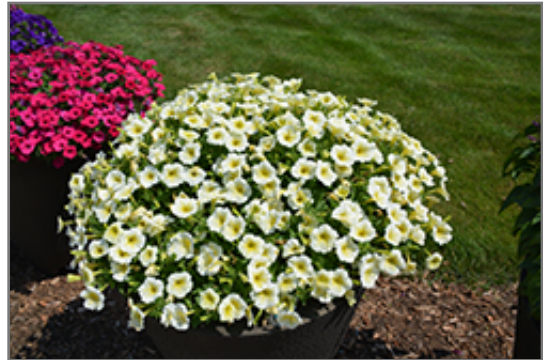
Supertunia Limoncello Petunia in bloom

Supertunia Limoncello Petunia will grow to be about 10 inches tall at maturity, with a spread of 30 inches. When grown in masses or used as a bedding plant, individual plants should be spaced approximately 18 inches apart. Its foliage tends to remain low and dense right to the ground. This fast-growing annual will normally live for one full growing season, needing replacement the following year.