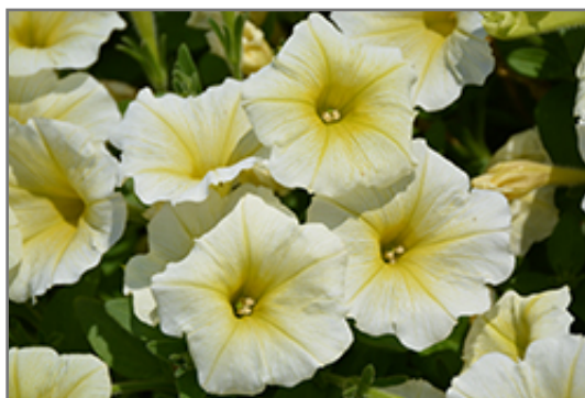
Supertunia Limoncello Petunia flowers

This plant will require occasional maintenance and upkeep. Trim off the flower heads after they fade and die to encourage more blooms late into the season. It is a good choice for attracting butterflies and hummingbirds to your yard, but is not particularly attractive to deer who tend to leave it alone in favor of tastier treats. It has no significant negative characteristics.