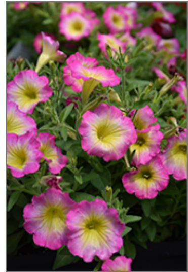
Supertunia Daybreak Charm Petunia flowers

This plant will require occasional maintenance and upkeep. Trim off the flower heads after they fade and die to encourage more blooms late into the season. It is a good choice for attracting butterflies and hummingbirds to your yard, but is not particularly attractive to deer who tend to leave it alone in favor of tastier treats. It has no significant negative characteristics.