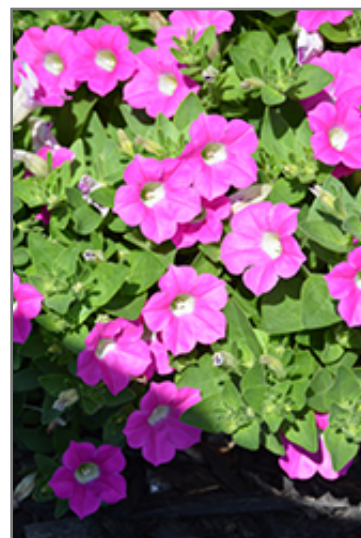
Blanket Rose Petunia flowers