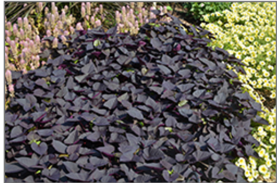
Sweet Caroline Sweetheart Jet Black Sweet Potato Vine

Sweet Caroline Sweetheart Jet Black Sweet Potato Vine is recommended for the following landscape applications;