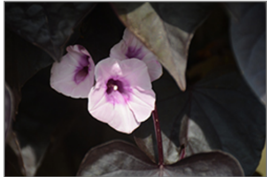
Sweet Caroline Sweetheart Jet Black Sweet Potato Vine flowers

Sweet Caroline Sweetheart Jet Black Sweet Potato Vine is a fine choice for the garden, but it is also a good selection for planting in outdoor containers and hanging baskets. Because of its trailing habit of growth, it is ideally suited for use as a 'spiller' in the 'spiller-thriller-filler' container combination; plant it near the edges where it can spill gracefully over the pot. Note that when growing plants in outdoor containers and baskets, they may require more frequent waterings than they would in the yard or garden.