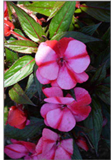
Infinity Blushing Crimson New Guinea Impatiens flowers

Infinity Blushing Crimson New Guinea Impatiens is recommended for the following landscape applications;