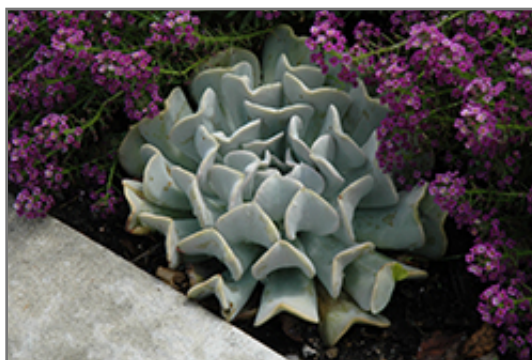
Topsy Turvy Echeveria

Topsy Turvy Echeveria is recommended for the following landscape applications;