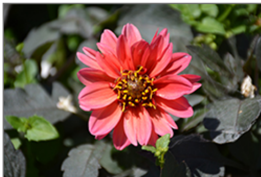
Dahlightful Sultry Scarlet Dahlia flowers