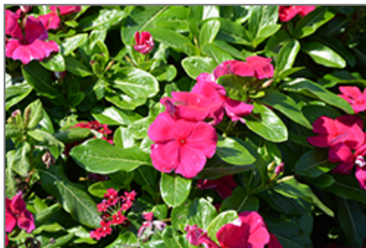
Cora Cascade Magenta Vinca flowers

Cora Cascade Magenta Vinca is recommended for the following landscape applications;