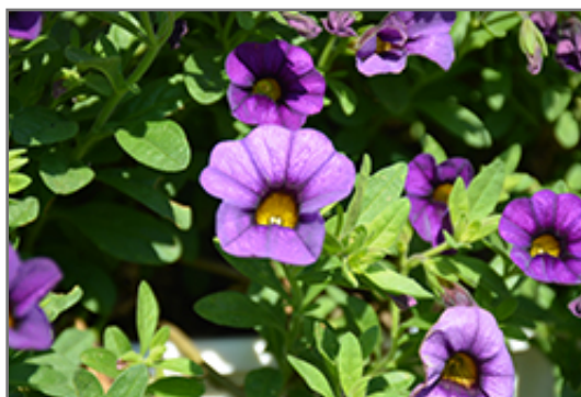
Million Bells Mounding Blue Calibrachoa flowers

Million Bells Mounding Blue Calibrachoa is recommended for the following landscape applications;