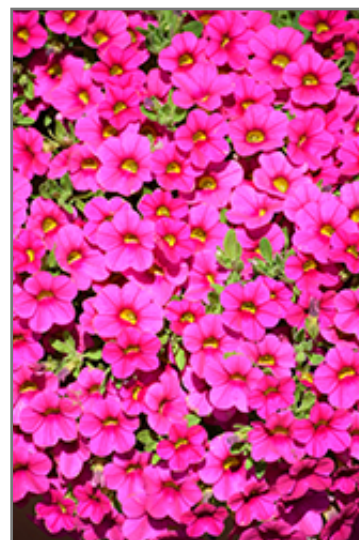
Million Bells Compact Brilliant Pink Calibrachoa flowers

Million Bells Compact Brilliant Pink Calibrachoa is recommended for the following landscape applications;