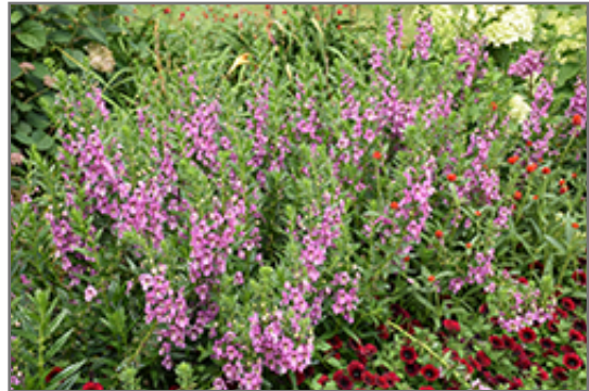
Angelface Super Pink Angelonia in bloom

Angelface Super Pink Angelonia is a fine choice for the garden, but it is also a good selection for planting in outdoor containers and hanging baskets. With its upright habit of growth, it is best suited for use as a 'thriller' in the 'spiller-thriller-filler' container combination; plant it near the center of the pot, surrounded by smaller plants and those that spill over the edges. Note that when growing plants in outdoor containers and baskets, they may require more frequent waterings than they would in the yard or garden.