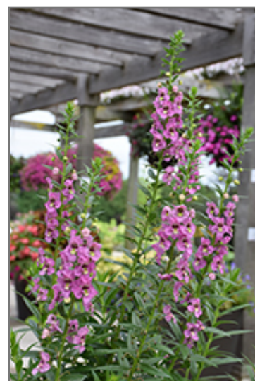
Angelface Super Pink Angelonia flowers