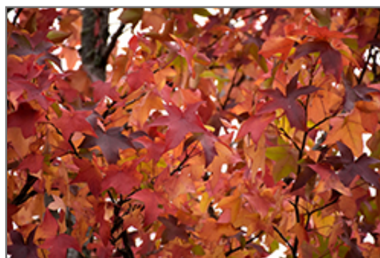
Sweet Gum in fall