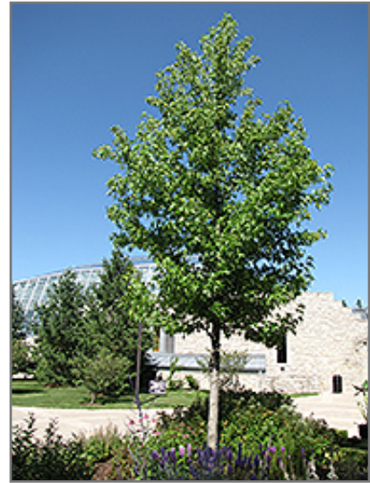
Sweet Gum

This plant is not reliably hardy in our region, and certain restrictions may apply; contact the store for more information.