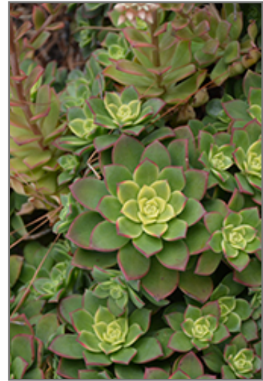
Kiwi Aeonium foliage

Kiwi Aeonium is a fine choice for the garden, but it is also a good selection for planting in outdoor pots and containers. Because of its spreading habit of growth, it is ideally suited for use as a 'spiller' in the 'spiller-thriller-filler' container combination; plant it near the edges where it can spill gracefully over the pot. Note that when growing plants in outdoor containers and baskets, they may require more frequent waterings than they would in the yard or garden.