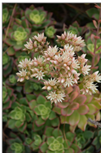
Kiwi Aeonium flowers