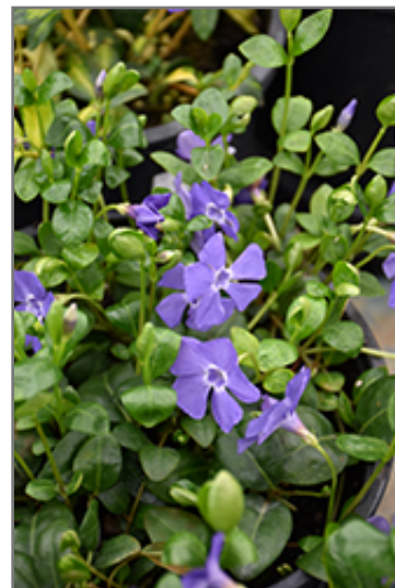
Bowles Cunningham Periwinkle flowers

Bowles Cunningham Periwinkle is recommended for the following landscape applications;