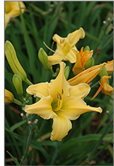
Empire Daylily flowers

Bright lemon yellow trumpeted flowers on strong, sturdy stems, rise above low growing mounds of arching green foliage; easy to grow, requiring little to no maintenance; perfect for large containers, beds and borders