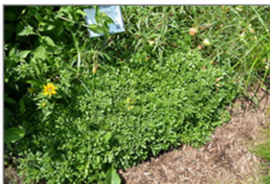
Czar's Gold Stonecrop