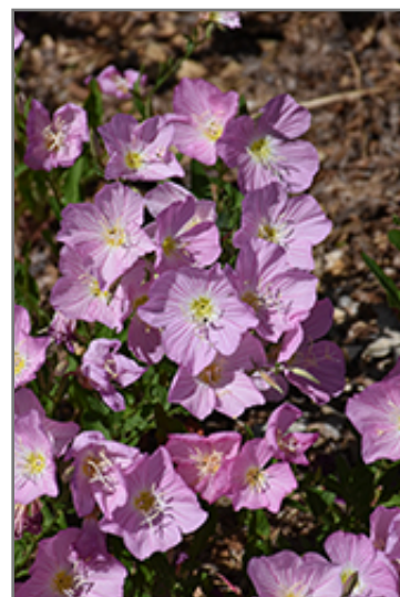
Twilight Evening Primrose flowers