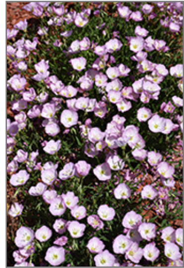
Twilight Evening Primrose flowers

Twilight Evening Primrose will grow to be about 12 inches tall at maturity, with a spread of 3 feet. When grown in masses or used as a bedding plant, individual plants should be spaced approximately 30 inches apart. Its foliage tends to remain dense right to the ground, not requiring facer plants in front. It grows at a fast rate, and under ideal conditions can be expected to live for approximately 10 years. As an herbaceous perennial, this plant will usually die back to the crown each winter, and will regrow from the base each spring. Be careful not to disturb the crown in late winter when it may not be readily seen!