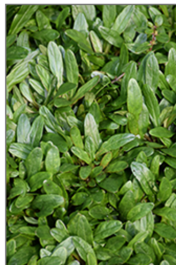
Emerald Chip Bugleweed foliage

Emerald Chip Bugleweed is recommended for the following landscape applications;