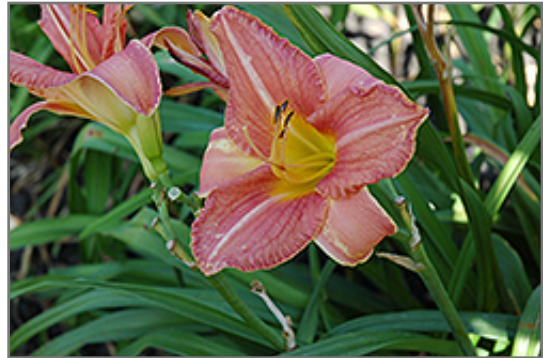
Chicago Peach Daylily flowers